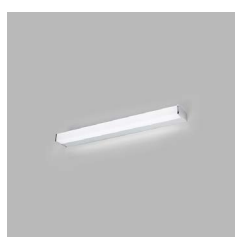
QUADRA 60 12W 3000K 960 lm