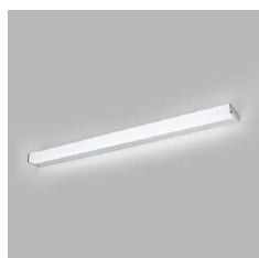
QUADRA 90 18W 3000K 1440 lm