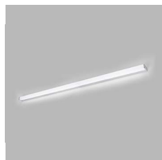
QUADRA 120 24W 2CCT 3000K/4000K 1920 lm